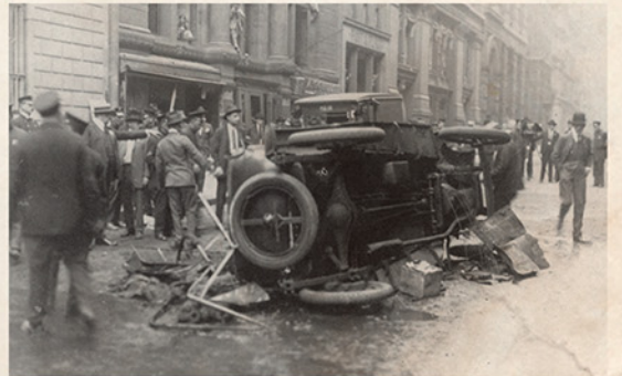
The massive explosion at the Times Square Bank damaged automobiles and littered 46th Street with rubble - no injuries have been reported.

From out of the darkness, shouts of "Look! They blew